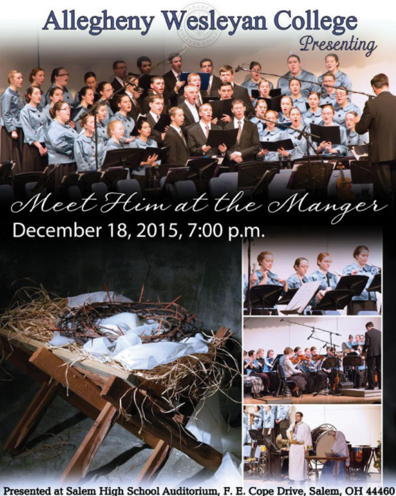
Presented at Salem High School Auditorium, F. E. Cope Drive, Salem, OH 44460 For more information 800.AWC.3153 • 2161 Woodsdale Road • Salem, OH 44460 • www.awc.edu